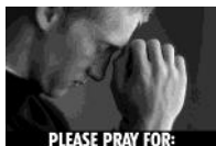
PLEASE PRAY FOR: